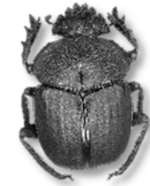
The Scarab Beetle, representing transformation, evolution, and regeneration of the soul after death.

Other faiths view humanity as mere “property” or “playthings” for the gods, but Setians believe each person is sovereign over him or herself. We do not have to accept our “Fate” or “God’s will,” for Set gives us the strength and the willpower to make our own prayers come true, as well as to forge our own destinies!