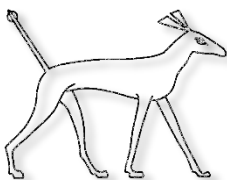
The Sha animal—the most important symbol for Set.

SETIANS are people who revere and emulate a god called SET .