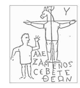
The <u>Alexamenos Graffito</u>, the earliest known image of Christ, in which he is depicted with Setian features.

any other religious traditions we personally value, including Christianity.